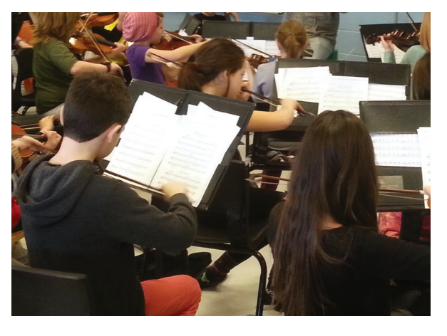
Sistema New Brunswick's young musicians in action.